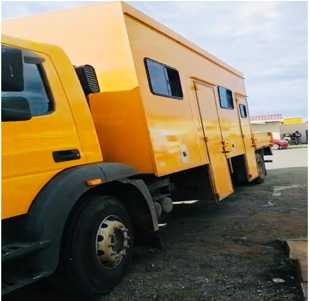
The left hand side