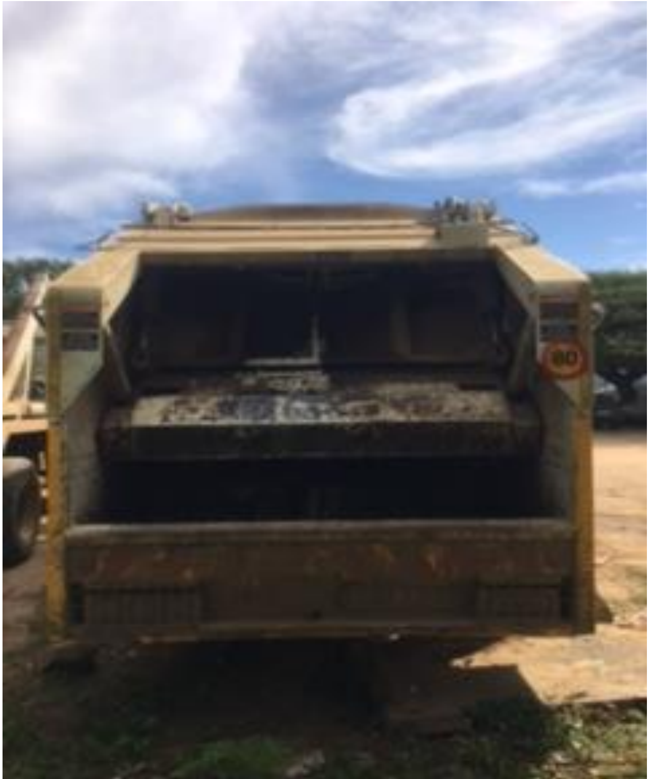
The left hand side