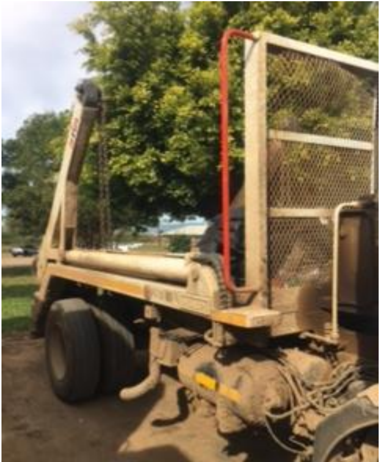
The left hand side