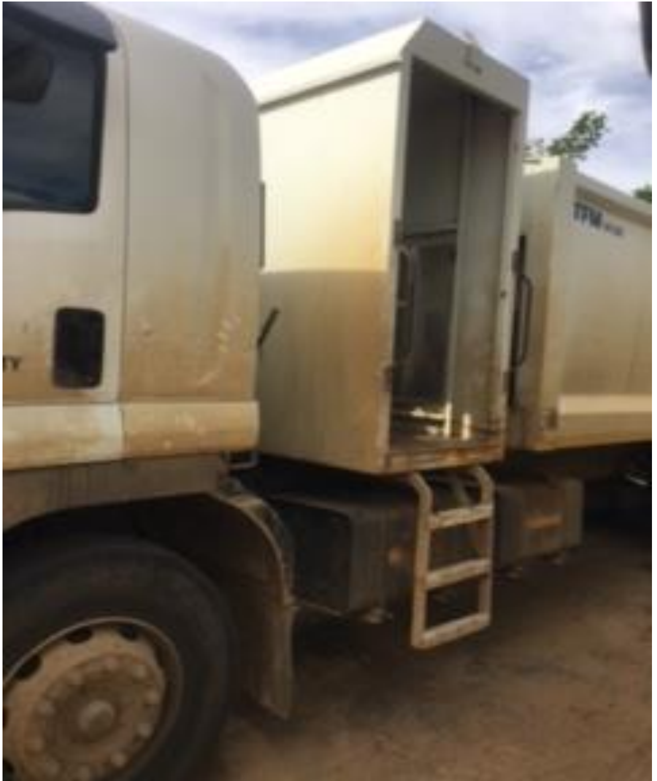
The skipper truck at the back