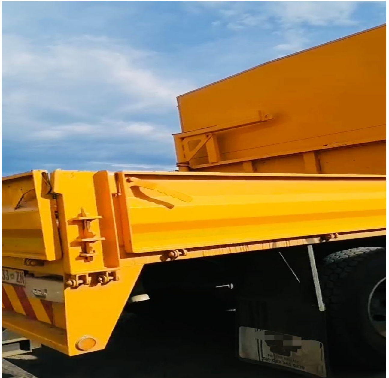
The bakkie and the back side