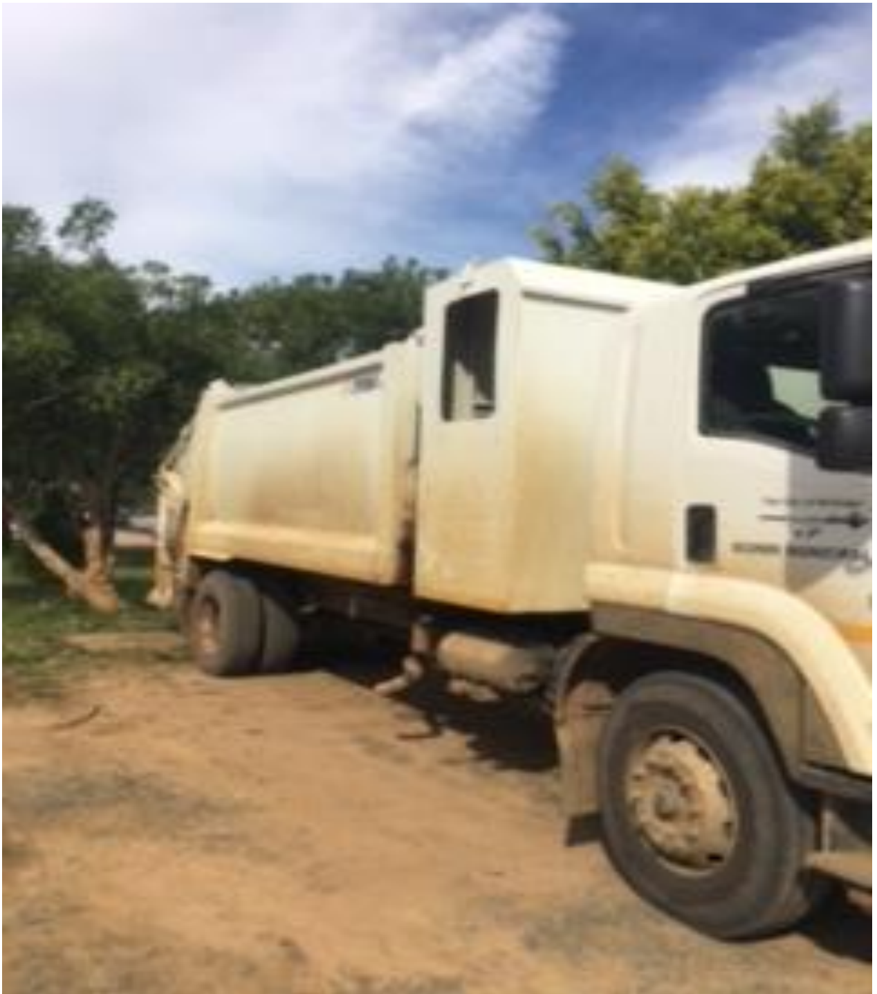
The back side