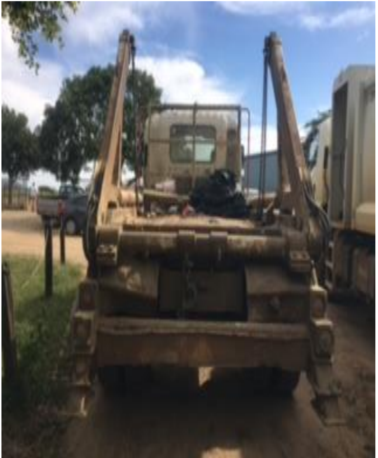
The right hand side