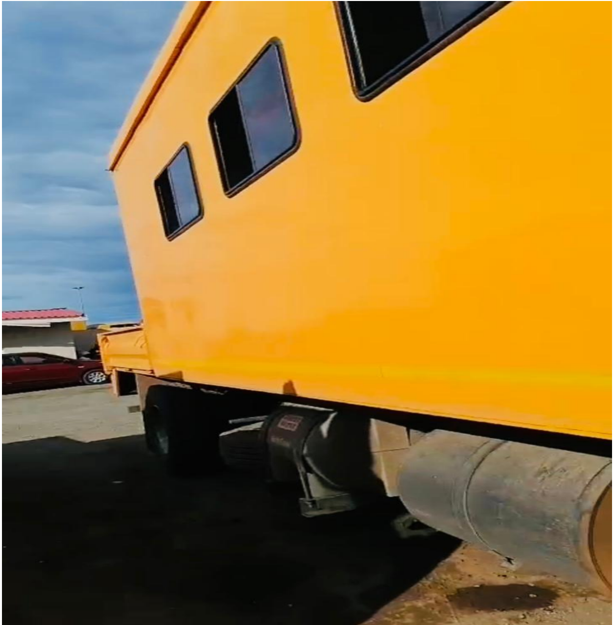
The right hand side