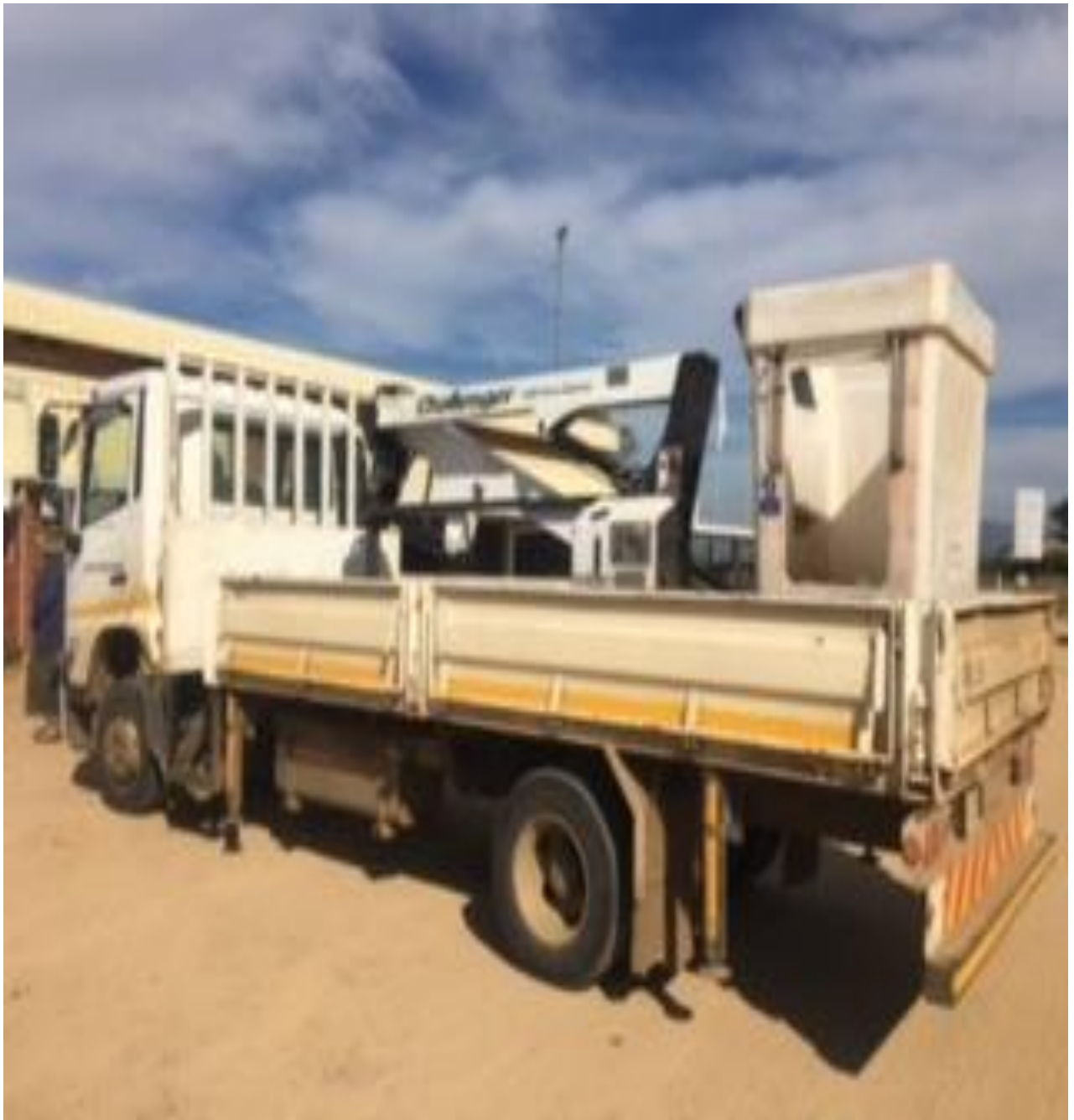
The top side