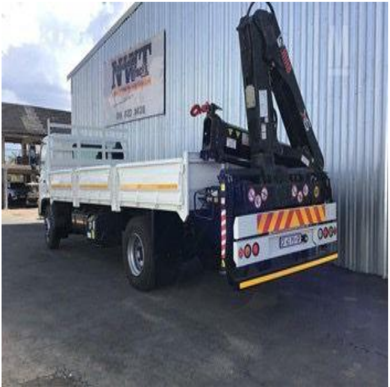
The crane machine mounted at the back